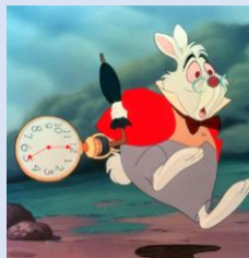
The White Rabbit

Tweedle Dee and Tweedle Dumb, Caterpillar, The March Hare, The Mad Hatter, Dormouse, Cheshire Cat, Queen of Hearts