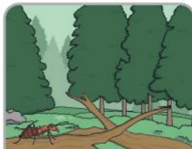
inside rotting wood